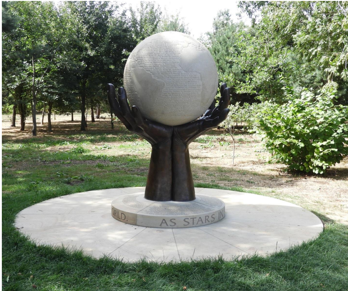
Memorial to the Nurses and Voluntary Aid Detachment Nurses & below – base showing names S - W