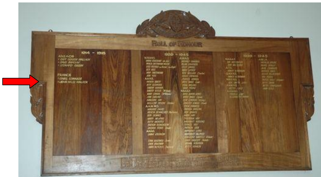
Collegiate School Honour Roll