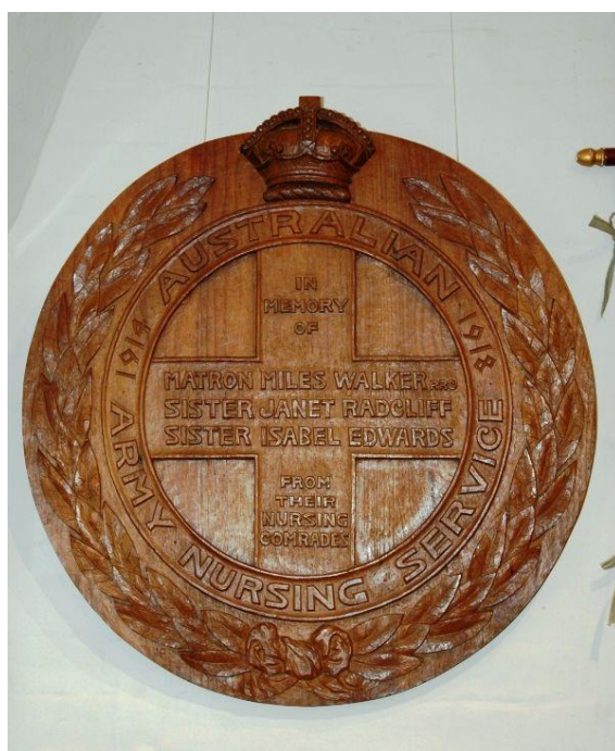
1914-1918 Australian Army Nursing Service Plaque